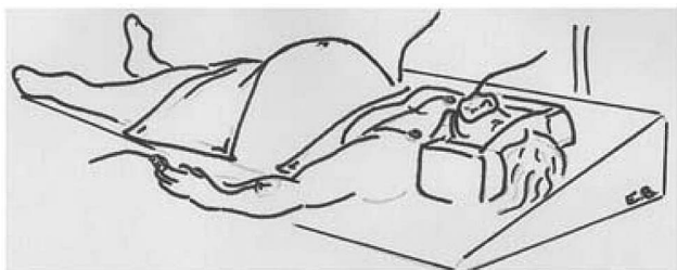
Figure 2 Spinal immobilisation tilted. Adapted from Battaloglu et al. 60

In order to achieve a sufficient patient tilt to alleviate SHS, any wedge or alternative should be placed below any spinal immobilisation devices wherever possible (see figure 2 ). 60 Also, the wedge should support the length of the spinal immobilisation device in order to be a stable platform and prevent hinging